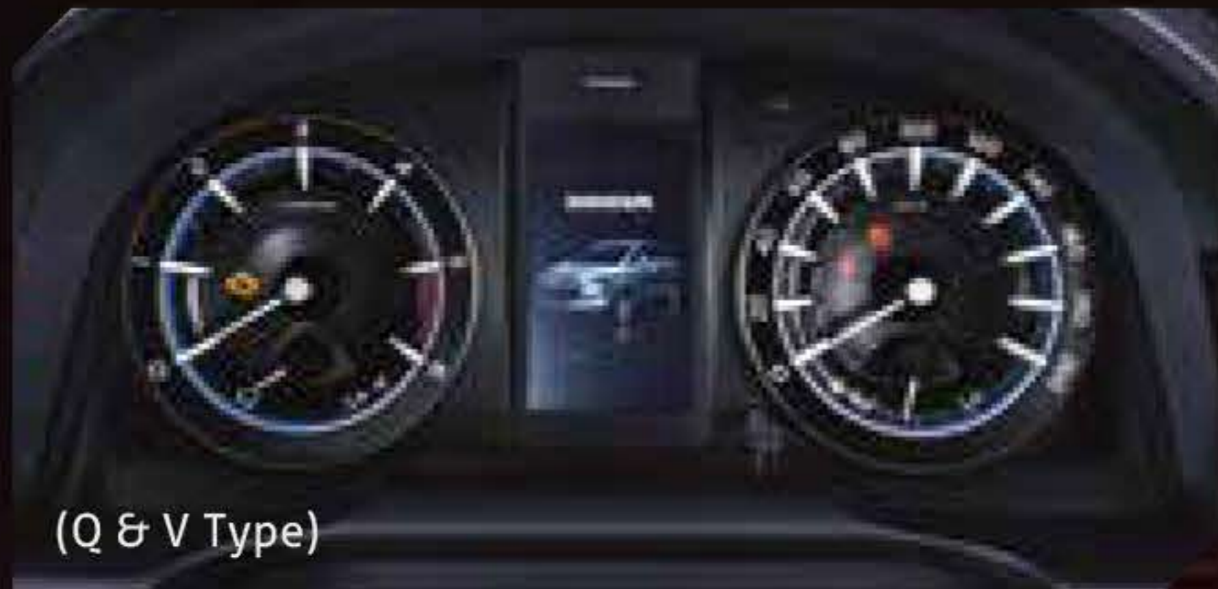
(Q & V Type)

TFT TYPE MID (Q & V Type) Innovative color display provides a range of essential information.