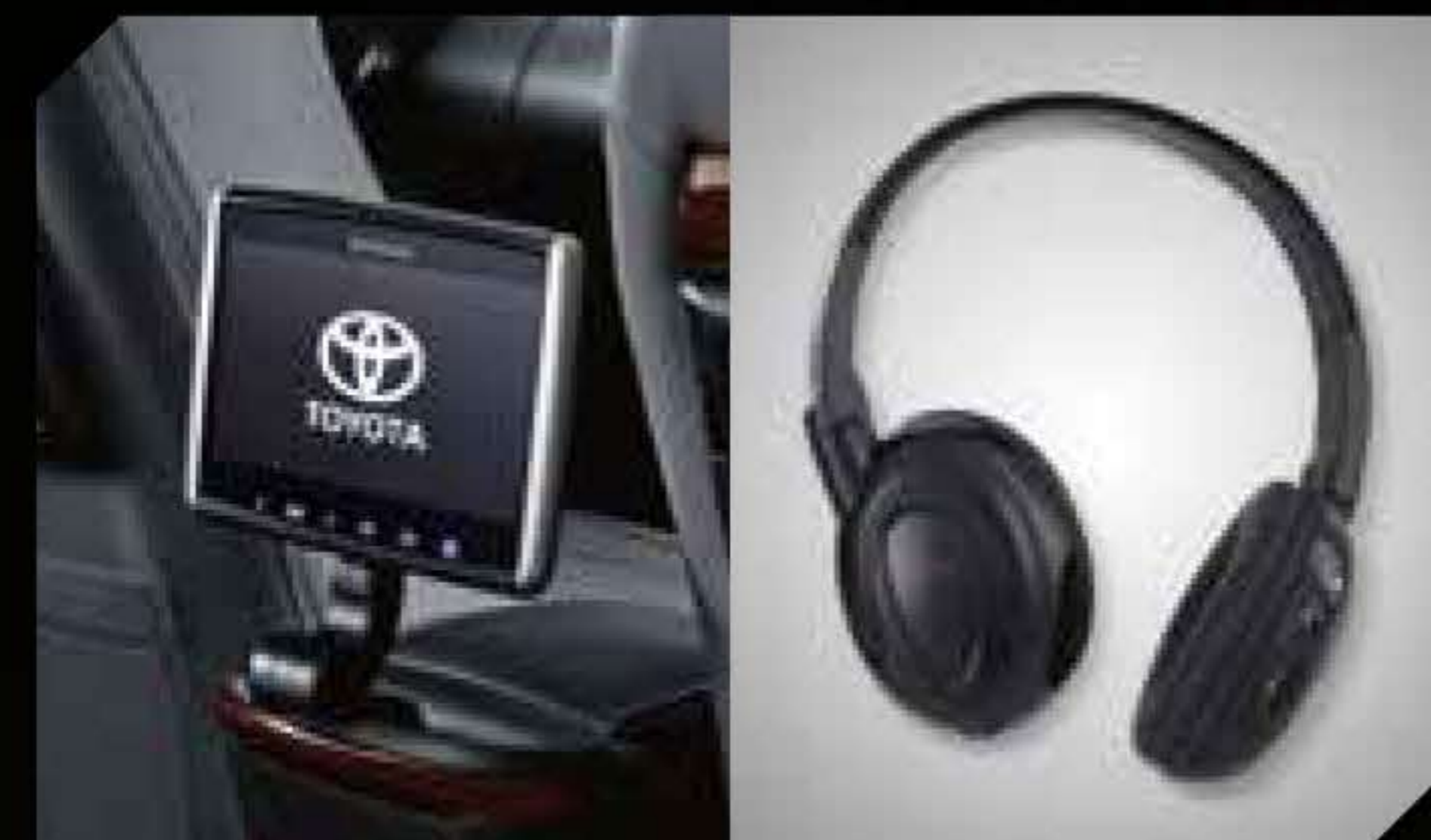
REAR SEAT ENTERTAINMENT (PC545-0K013) + HEADPHONE FOR RSE (PZ076-BZ557) Premium entertainment for rear seat passengers provides more excitement in travel.