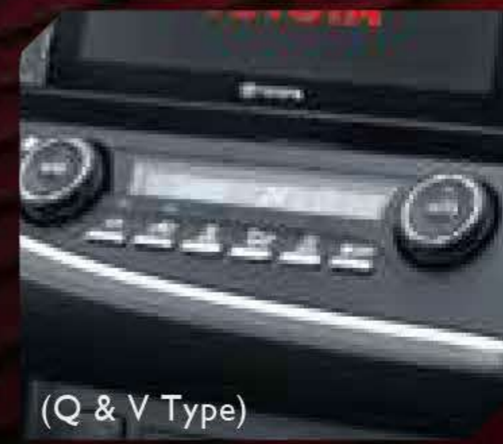
(Q & V Type)

PREMIUM ILLUMINATION LED (Q & V Type) Premium ambient light provides exquisite traveling comfort.