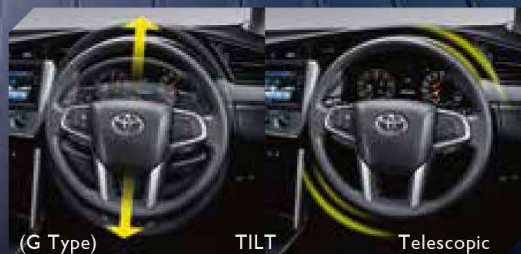
(G Type) TILT Telescopic

TILT AND TELESCOPIC STEERING (All Type) Fully adjustable steering wheel for driving comfort and confidence.