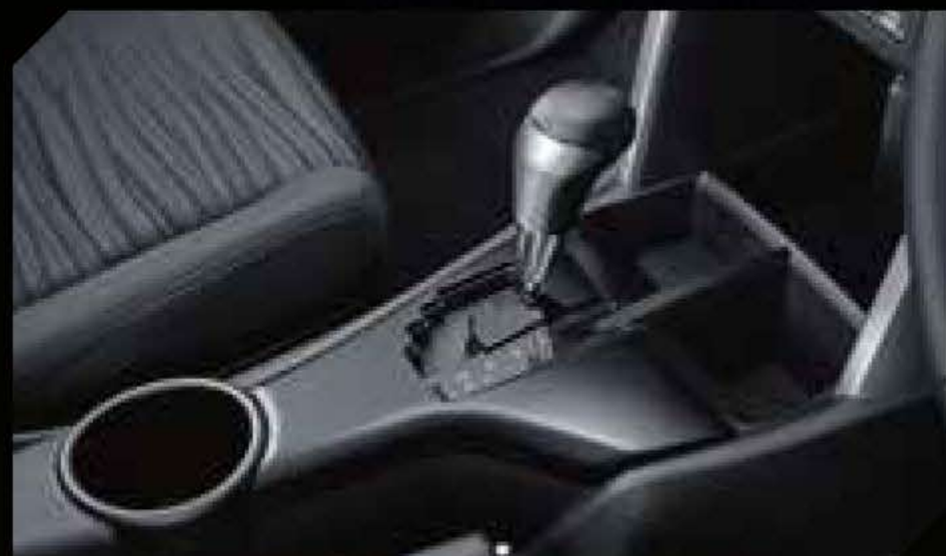
SHIFT LEVER BEZEL ORNAMENT (AT ONLY) (P5288-0KA02) The latest transmission system combined with sophisticated new shift lever bezel design for a smooth and stylish driving experience.