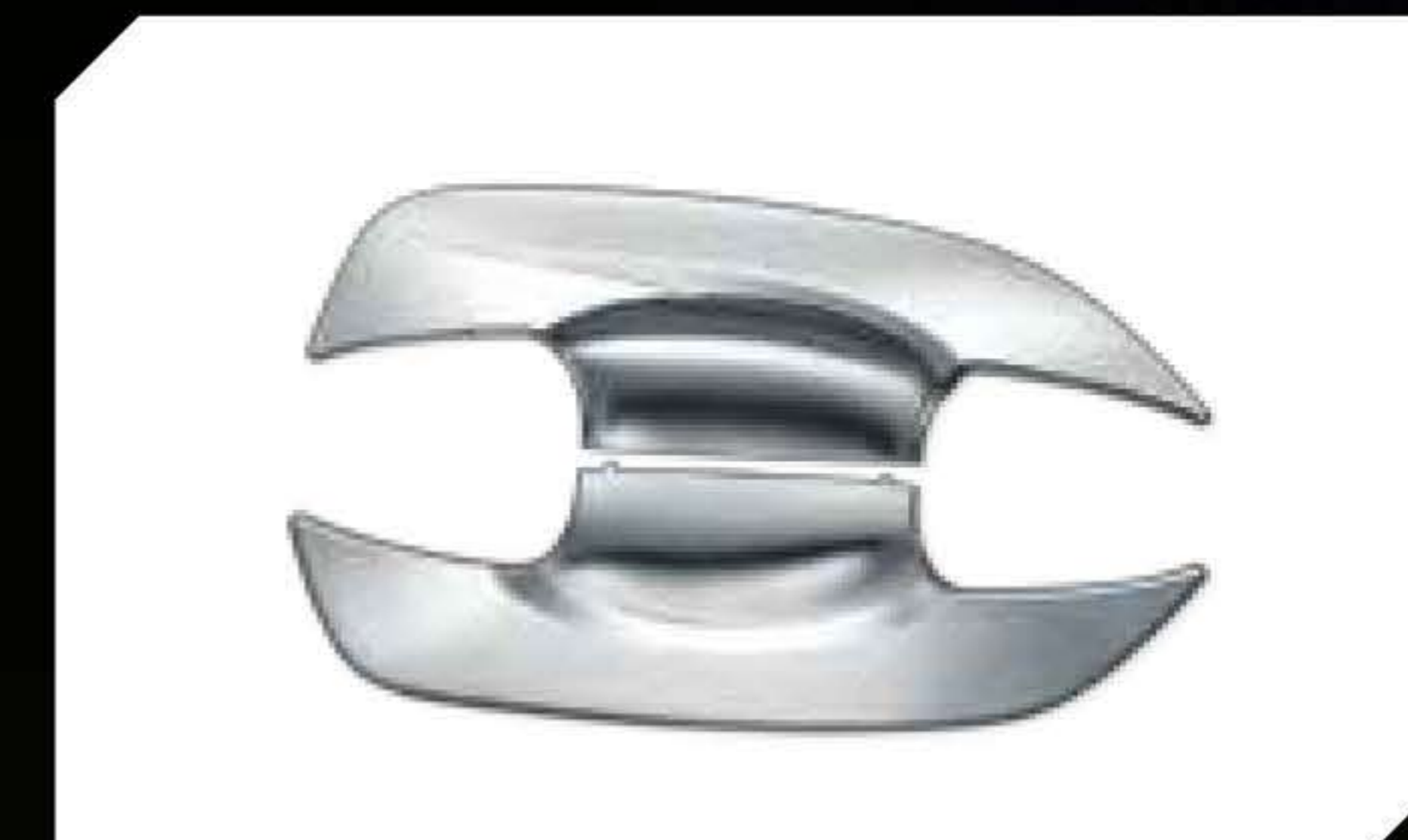
CHROME DOOR HOUSING (P5168-0KA02) Extra protection with a glossy touch of elegance