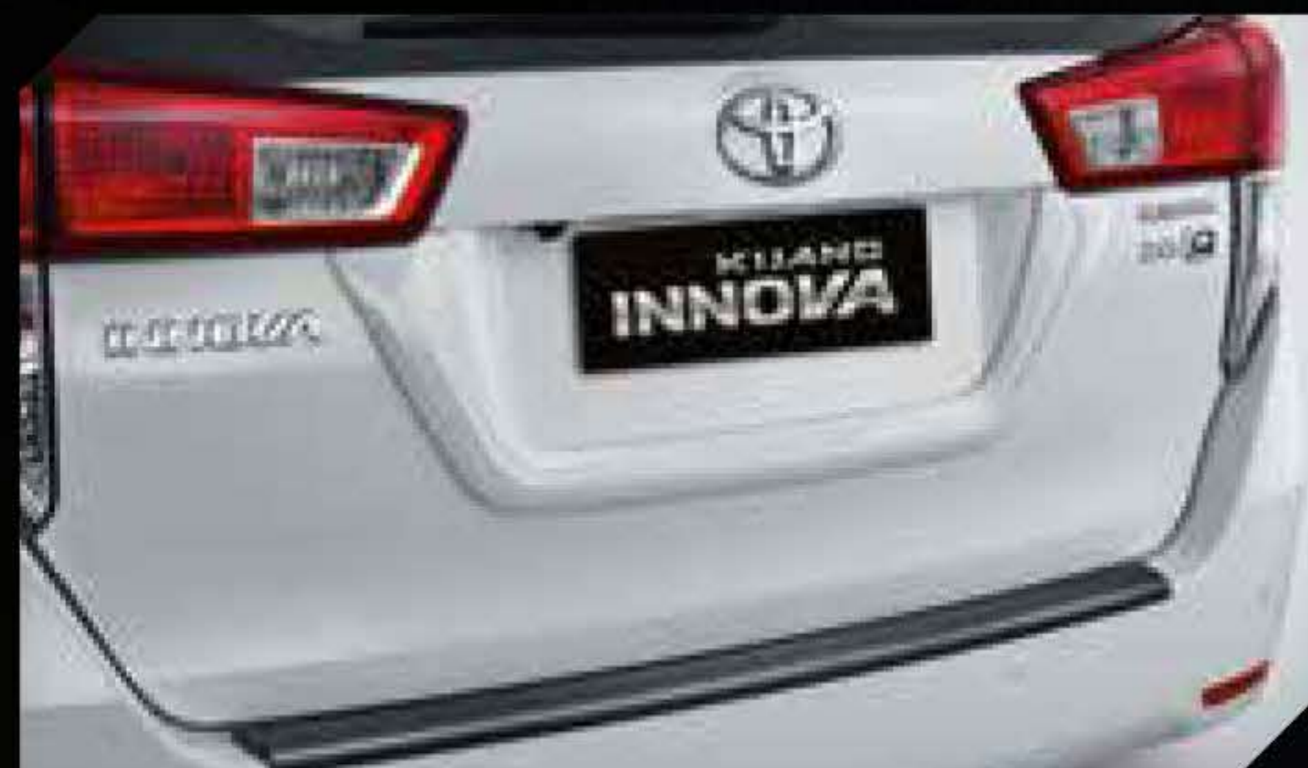
REAR LICENSE GARNISH (P5407-0KA02) Bold new ornaments as a stylish enhancement to the rear design.

Bring extra touch of convenience and comfort with a range of additional accessories to elevate the delightful experience.