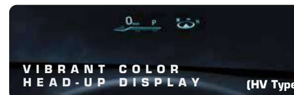
VIBRANT COLOR HEAD-UP DISPLAY