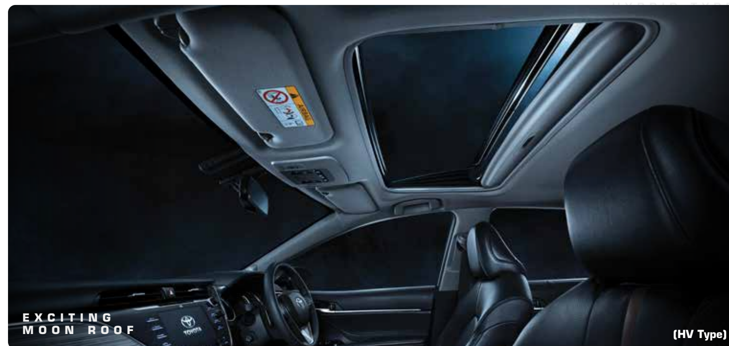
EXCITING MOON ROOF

Ensure your safety with Rear Cross Traffic-Alert that will keep you alert to vehicles approaching from each side when reversing and let the Blind Spot Monitor alert you to vehicles in blind spots using radar technology.