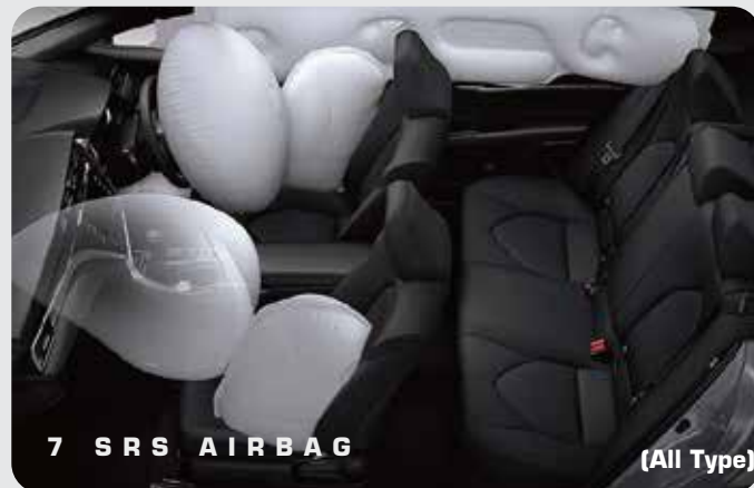
7 SRS AIRBAG

The seven airbags technology will keep all the passengers safe, reducing impact in the case of collision and giving each individual a comfortable ride in maximum safety.