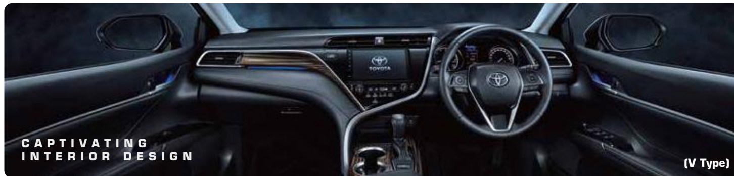
CAPTIVATING INTERIOR DESIGN