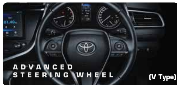
ADVANCED STEERING WHEEL