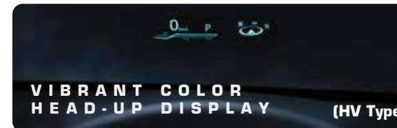
VIBRANT COLOR HEAD-UP DISPLAY