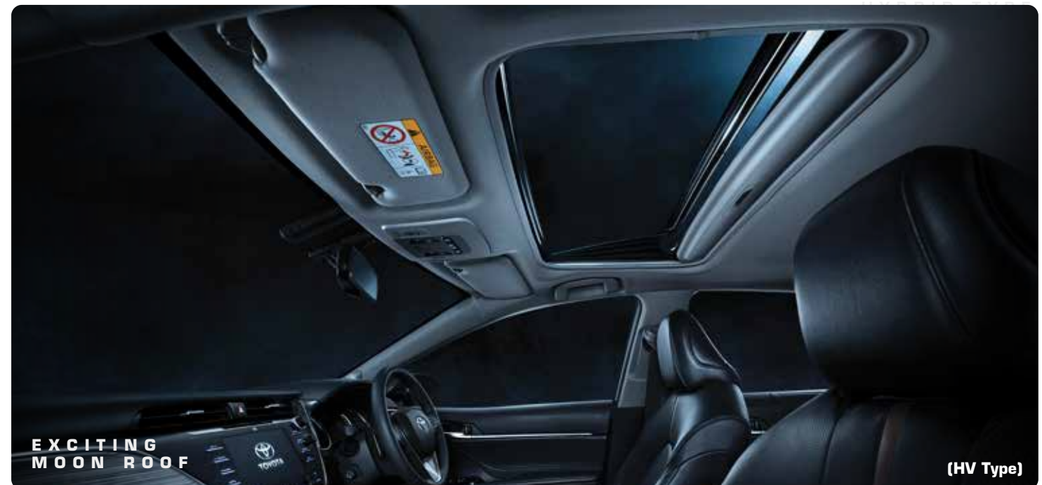
EXCITING MOON ROOF

Ensure your safety with Rear Cross Traffic-Alert that will keep you alert to vehicles approaching from each side when reversing and let the Blind Spot Monitor alert you to vehicles in blind spots using radar technology.