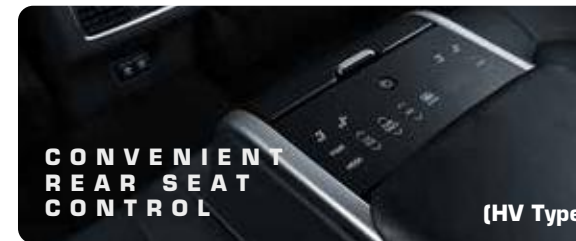
CONVENIENT REAR SEAT CONTROL